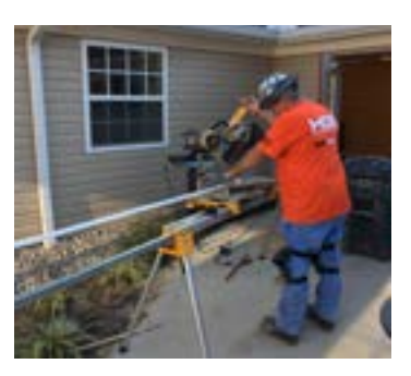
ARTIS SENIOR LIVING National Senior Living Facility New construction of senior living facilities in PA, OH, and FL

GORILLA GLUE HEADQUARTERS Renovation Renovation of dated office building into modern, usable space